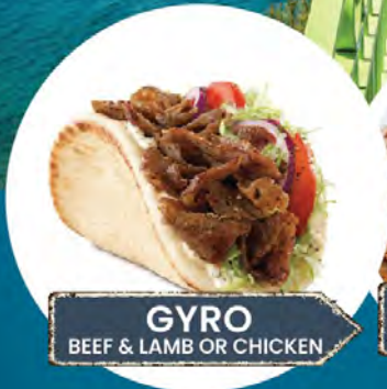
GYRO BEEF & LAMB OR CHICKEN