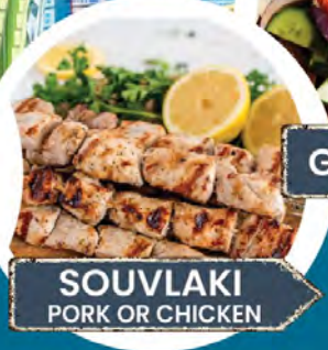
SOUVLAKI PORK OR CHICKEN