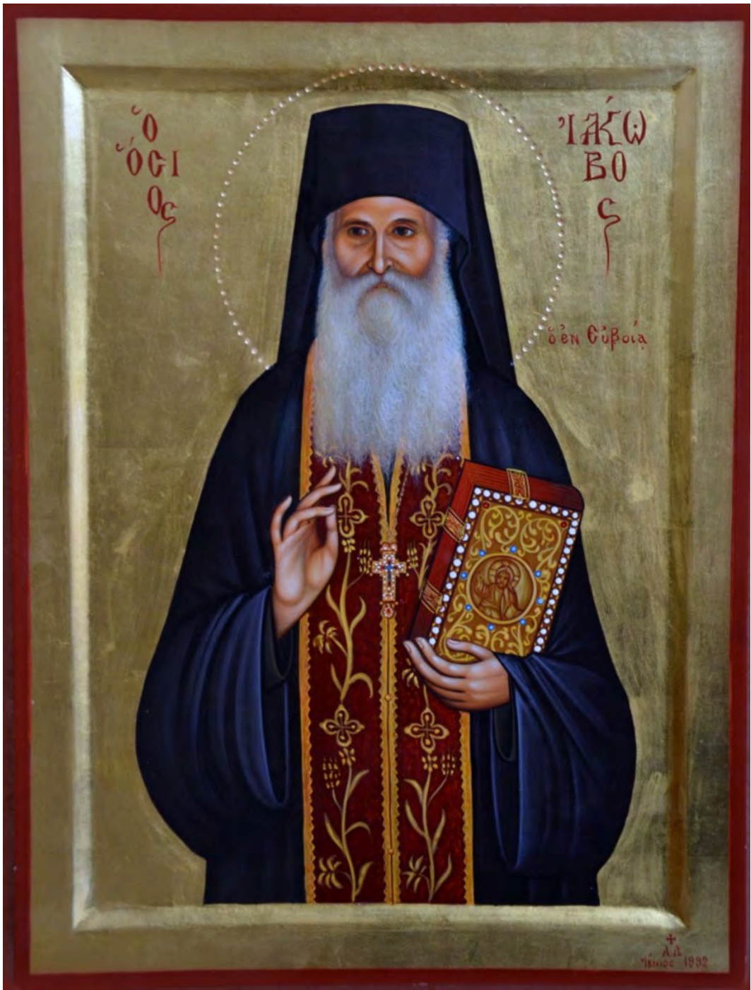
THE NEW PATRON SAINT OF THE METROPOLIS OF NEW JERSEY